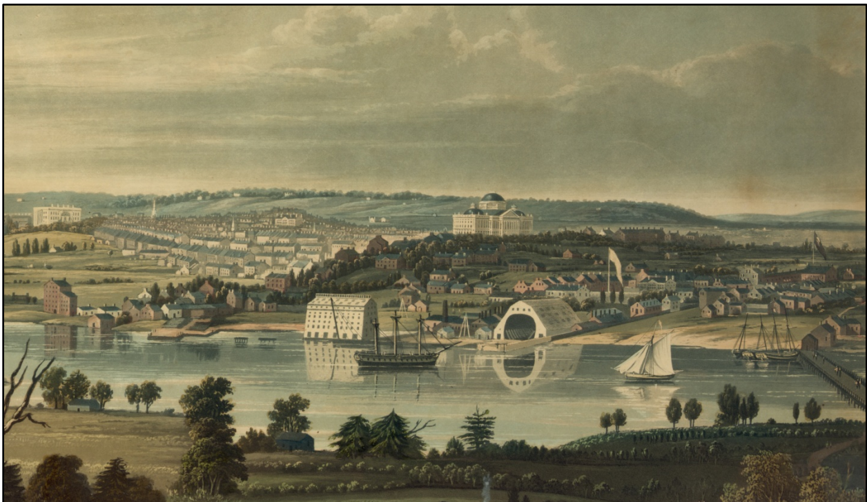
Washington, DC in 1833. The Navy Yard can be seen along the Anacostia River, the Capitol building is on the hill in the center and the White House is on the left.

Throughout this era of profound change one steady factor for many was the close ties of Naval Lodge brethren with the shipyard, which was to remain a bright constant in trying times.