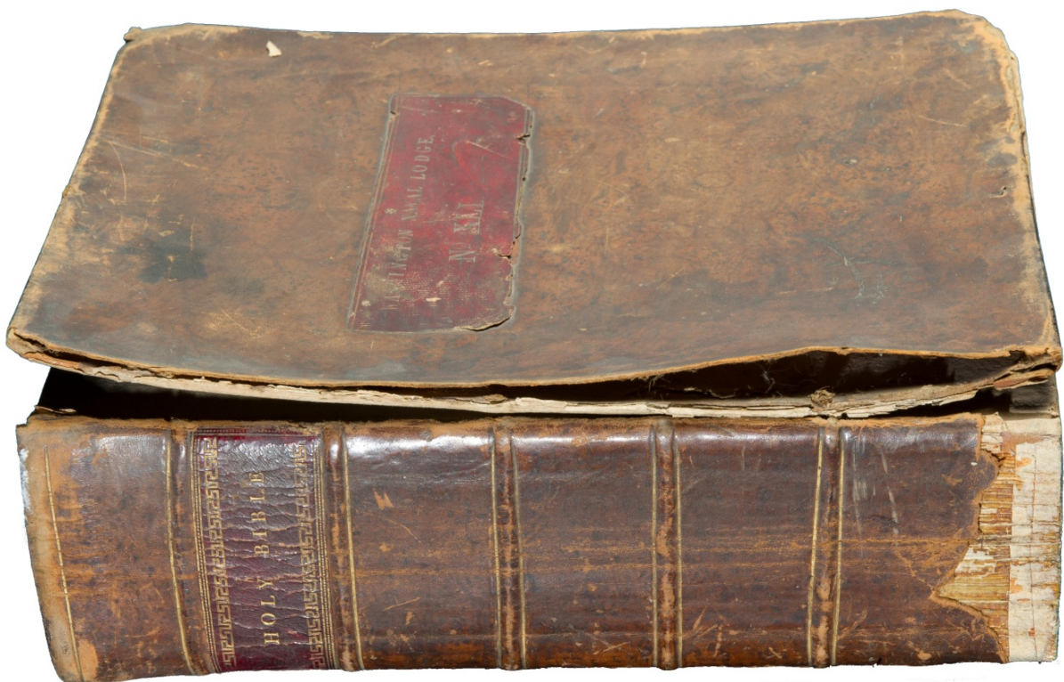
Naval Lodge's first bible, published 1803, and likely in use in 1812.

Ordered that a copy of the foregoing resolution and proposed amendment to the constitution be transmitted by the Grand Secretary to the Lodges within this jurisdiction. _____